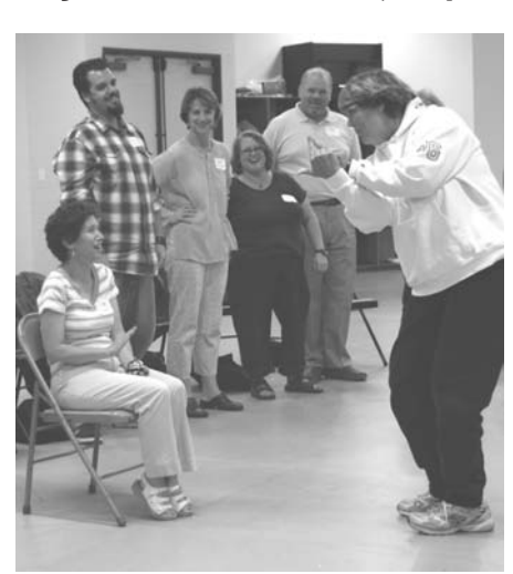
THEATRE TEACHERS PARTICIPATE IN AN OLD GLOBE PROFESSIONAL DEVELOPMENT SEMINAR.

Starting with our youngest constituents, The Old Globe has entered into a partnership with Valencia Park Center for Academics, Drama and Dance in Southeast San Diego. This magnet school is one of the very few primary schools with a real