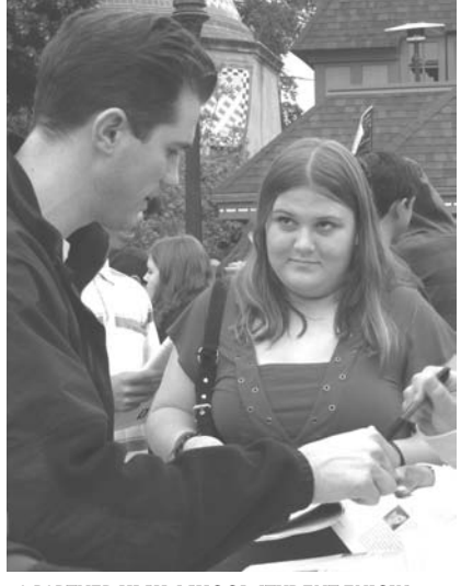
A PARTNER HIGH SCHOOL STUDENT ENJOYS AN AUTOGRAPH SESSION WITH ACTOR, MATT CAVENAUGH, AFTER A FREE STUDENT MATINEE OF A CATERED AFFAIR

schools give their students excellent opportunities to participate in theatre in all capacities. Through solid training in the performance and technical aspects of theatre, students are preparing for possible higher education or careers in professional theatre. High schools gain special benefits as Old Globe partners: Theatre students attend all of the free student matinees that the Theatre OF A CATERED AFFAIR.